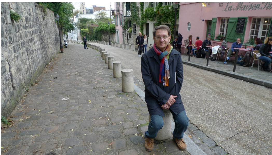
Fig. 5. Visiting Montmartre.