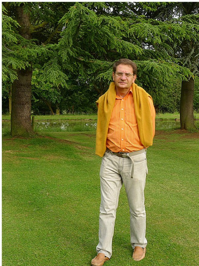
Fig. 9. In between the conference talks.