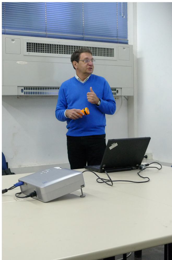
Fig. 2. Giving a conference talk.