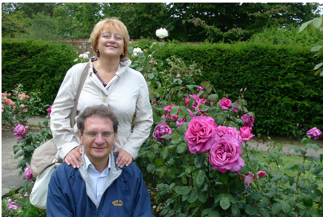
Fig. 7. With wife.