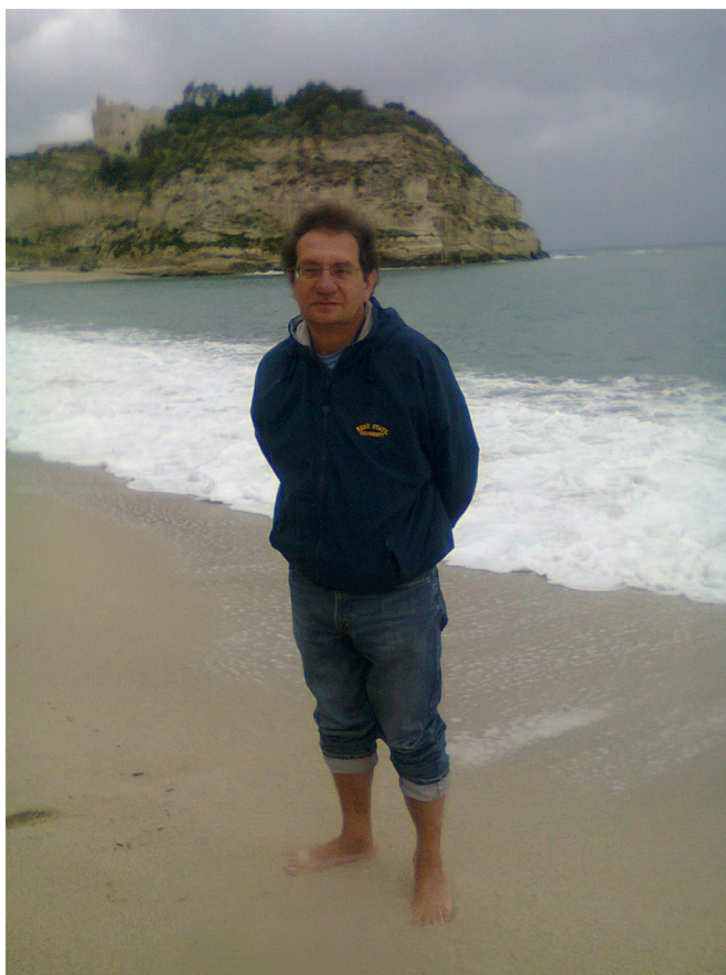
Fig. 10. On vacation.