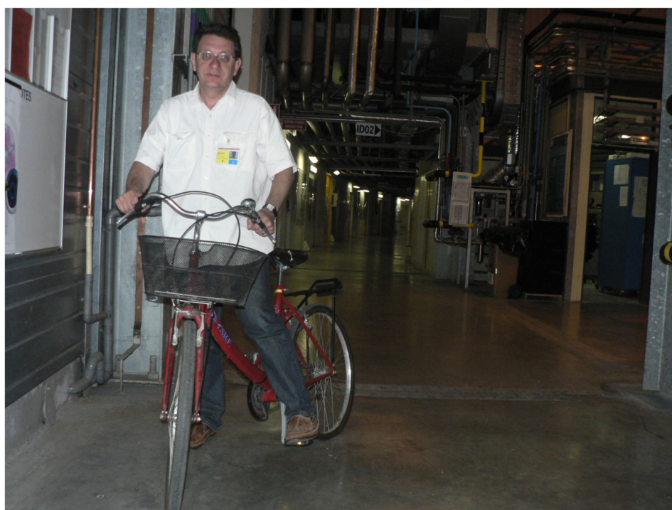
Fig. 3. Visiting the lab (Grenoble).