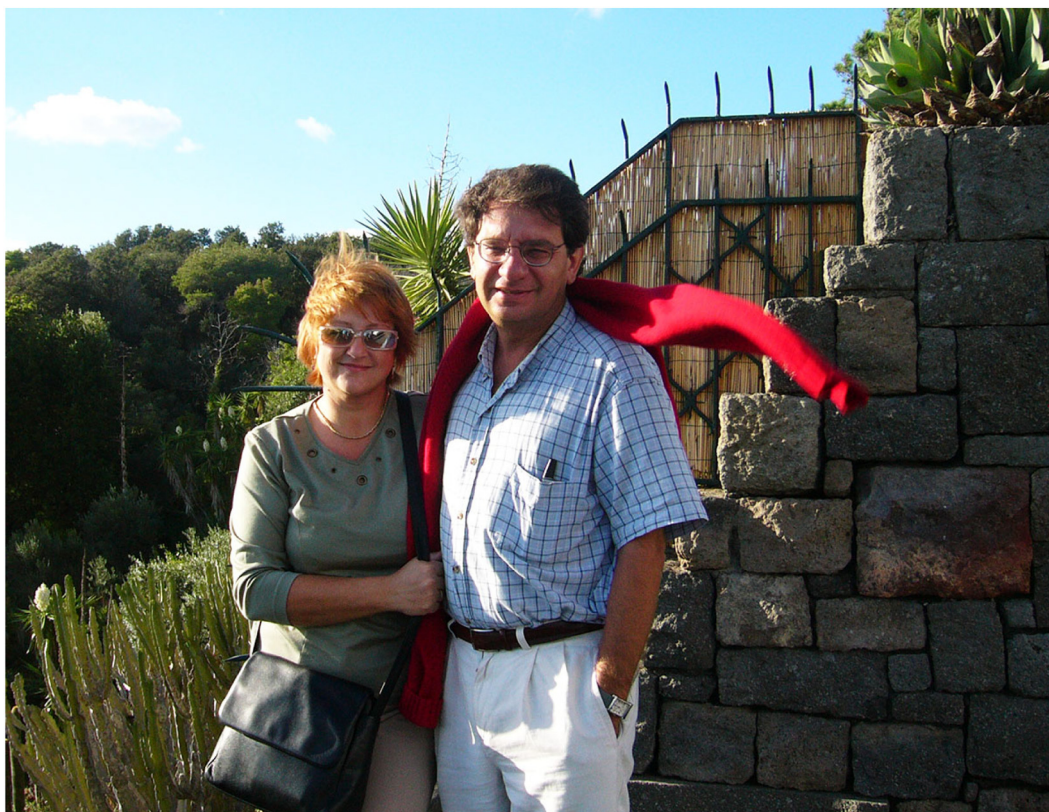
Fig. 6. With wife.