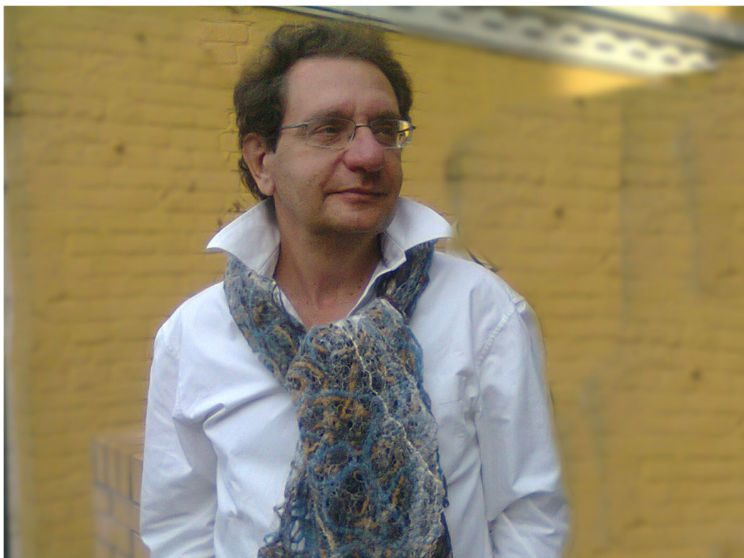
Fig. 4. Sunday walk (Kyiv).