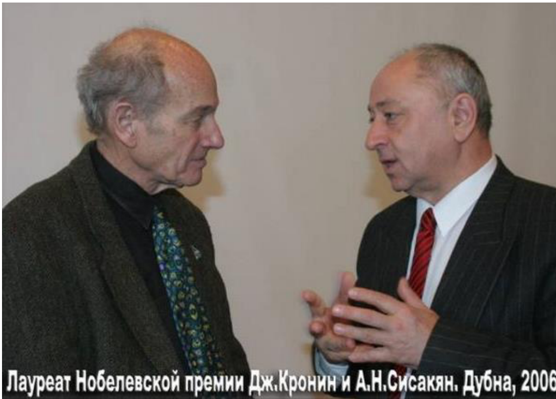
Лауреат Нобелевской премии Дж.Кронин и А.Н.Сисакян. Дубна, 2006

Текст составлен с использованием материалов: