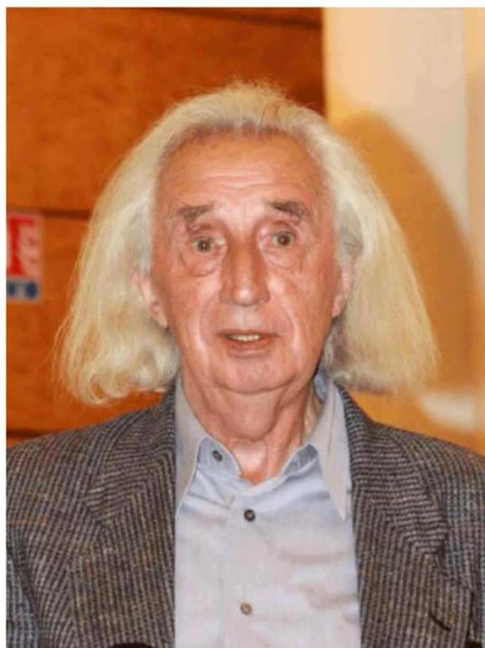
Игорь Ехиельевич Дзялошинский (01.02.1931 – 14.07.2021)

Советы и научные консультации Дзялошинского всегда пользовались широким спросом. Его научные